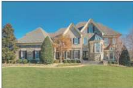
CONTRACT on Alpine Bay