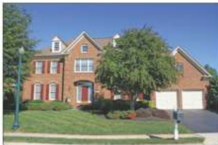
JUST LISTED on Spyglass Hill