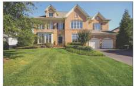
FOR SALE on Link Hills

If you are thinking of selling or renting your home, or need property management assistance please call us for an interview. By utilizing our highly effective marketing strategy, extensive neighborhood knowledge & unmatched professional service, we guarantee your complete satisfaction!