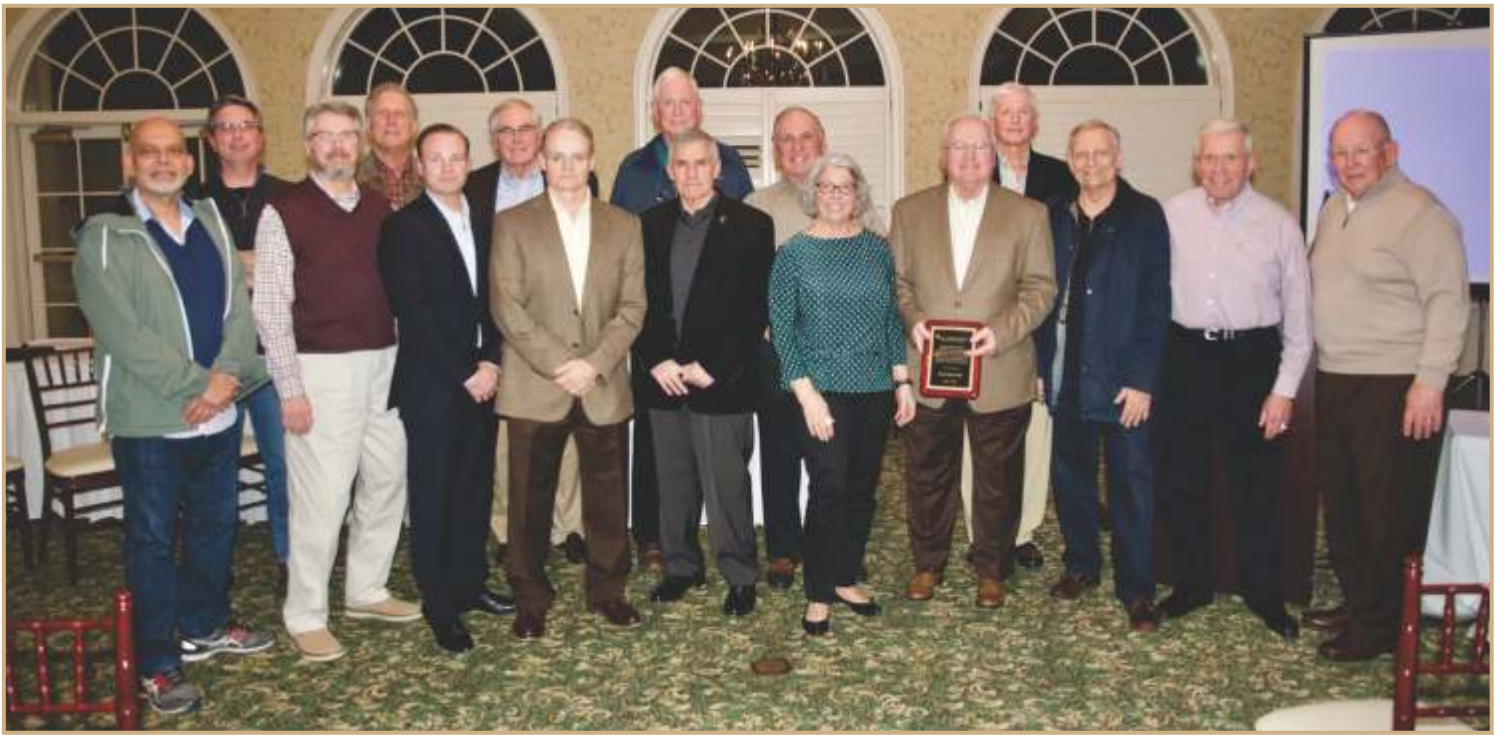
Past and Current Lake Manassas Community Volunteers