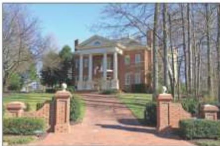
JUST LISTED on Valderrama