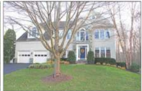
JUST SOLD on Windy Hollow