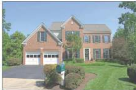
JUST SOLD on Cancun