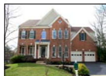
8052 Arcadian Shore Court