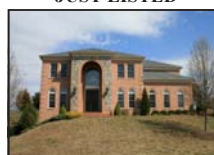
8317 Hancock Court