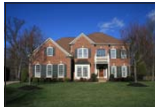
7974 Bonnie Briar Loop