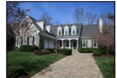
7998 Bonnie Briar Loop