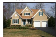
8011 Amsterdam Court

If you are thinking of selling or renting your home, please call us for an interview. With our proven marketing plan, extensive neighborhood knowledge & unmatched professional service, we guarantee your complete satisfaction!