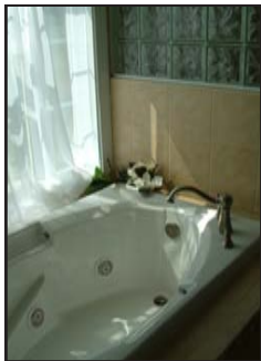
Virginia Class A Contractor - Master Plumber and Gasfitter - Certified in Radiant Heat, Wardflex and Backflow Prevention