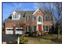
15192 Windy Hollow Circle