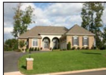
15870 Spyglass Hill Loop