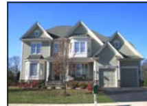
8432 Link Hills Loop